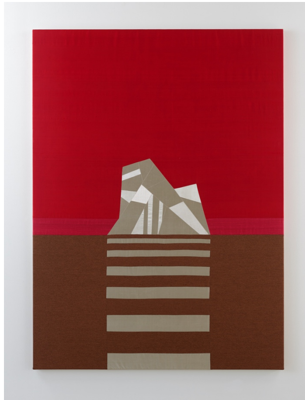
Angelo Filomeno, Island (Red, Silver, Copper) , 2022, silk shantung stretched over canvas 68 x 50 in (172.7 x 127 cm). Courtesy the Artist and Galerie Lelong & Co., New York.

CHART, in collaboration with Galerie Lelong & Co., is pleased to present By the ocean waiting for sunset , an exhibition of new paintings by Angelo Filomeno. This is Filomeno's first New York solo exhibition in seven years, and will be installed across both floors of the gallery. Eleven recent paintings will fill the main gallery, paired with an installation of related smaller works on the gallery's lower level. There will be an opening reception on Friday, May 6 from 6-8 pm and the exhibition will remain on view through June 18.