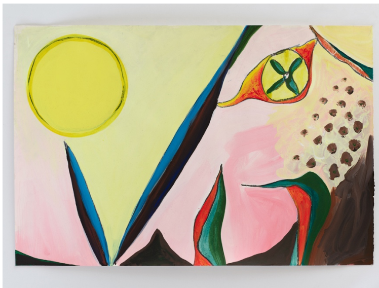
Anthony Miler, Not Titled , acrylic, gouache, and graphite on woven cotton paper, framed: 26 1/2 x 35 5/8 in (67.3 x 90.5 cm).

Despite Miler's turn to more meticulous mark-making, especially in the detailing of the "eyes" that populate his canvases, it remains difficult to refer to Miler's paintings as exactly representational. In Miler's work, the singular, cyclopean eye operates as a hinge between the worlds of figuration and abstraction. The symbol serves as the minimal possible gesture necessary to break the spell of total abstraction, while also resisting any further formal readings or turns toward pareidolia. The viewer is left vacillating between the two genres, constantly reevaluating their relative ratios.