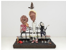
Will Ryman Give Us A Shot , 2022 wood, bronze, resin, brass bullets, steel chain, feathers, burlap, paint, taxidermy pigeon, nails, copper wire, polyurethane foam, newspaper clippings 85 x 74 x 49 inches (WR027)