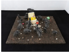
Will Ryman Popcorn , 2022 steel, nails, resin, paint, copper wire, wood, screws 16 3/4 x 48 1/2 x 48 1/2 inches (WR030)