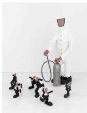
Will Ryman The Exterminator , 2008/2022 wood, resin, mesh, paint, screws, hose, plastic 65 x 105 1/2 x 159 1/2 inches (WR025)