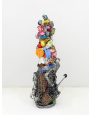
Will Ryman Utopia , 2022 steel, resin, aluminum wire, paint, newspaper clippings 59 1/2 x 21 x 22 1/2 inches (WR026)