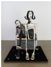
Will Ryman Cinderella Story , 2022 resin, wood, wire, steel, nails, brass, paint, carpet, sneakers 61 x 48 x 48 inches (WR028)