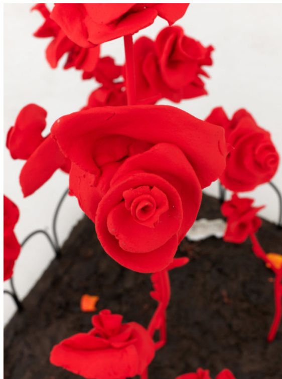
Will Ryman, The Hip Hop Streets , 2022, wood, metal, resin, paint, wire, paper, 39 x 32 x 24 inches; The Hip Hop Streets [detail], 2022. © Will Ryman / Artists Rights Society (ARS), New York, 2022. Courtesy the artist and CHART. Photos by Elisabeth Bernstein.