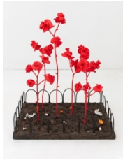
Will Ryman The Hip Hop Streets , 2022 wood, metal, resin, paint, wire, paper 38 1/2 x 32 x 25 inches (WR023)