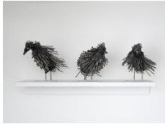
Will Ryman Pigeons , 2022 screws, nails, resin, steel, wood 6 1/2 x 24 x 9 inches (WR031)