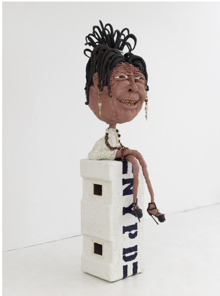
Will Ryman, NYPD , 2022, wood, steel, mesh, resin, paint, chains, locks, buttons, 92 x 22 x 29 inches. © Will Ryman / Artists Rights Society (ARS), New York, 2022. Courtesy the artist and CHART. Photo by Elisabeth Bernstein.

September 9 - October 22, 2022 Opening Friday, September 9, 6 - 8 pm