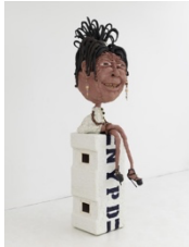
Will Ryman NYPD , 2022 wood, steel, mesh, resin, paint, chains, locks, buttons 92 x 30 x 38 inches (WR022)