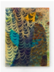
Kiwha Lee Pendulum , 2023 oil on canvas 24 x 18 in 61 x 45.7 cm (CH1302)