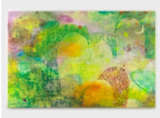
Kiwha Lee Light Years , 2023 oil on canvas 66 x 102 in 167.6 x 259.1 cm (CH1301)