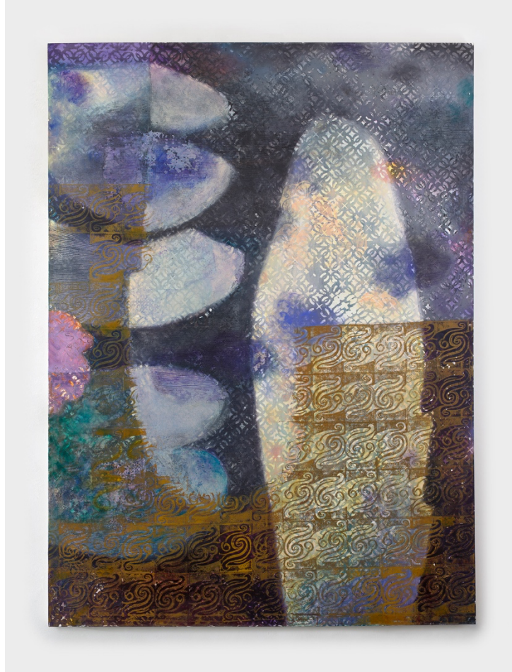
Kiwha Lee, Noble Discontent , 2023, oil on canvas, 72 x 53 inches, 182.9 x 134.6 cm

CHART is pleased to present Light Punch , a solo exhibition by Kiwha Lee. Featuring a suite of new paintings, her work poses questions about what painting is in the 21st century, complicating the viewer's reading of pictorial hierarchy by engaging pattern as a narrative tool. Taking ancient Asian printmaking processes derived from craft traditions and reinventing them with oil paint, Lee explores notions of intersubjectivity between vision and immersion in the physical world. The exhibition, Lee's first solo show in New York, will open with a reception on Friday, January 19, from 6–8pm, and remain on view through March 9, 2024.