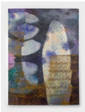
Kiwha Lee Noble Discontent , 2023 oil on canvas 72 x 53 in 182.9 x 134.6 cm (CH1184)