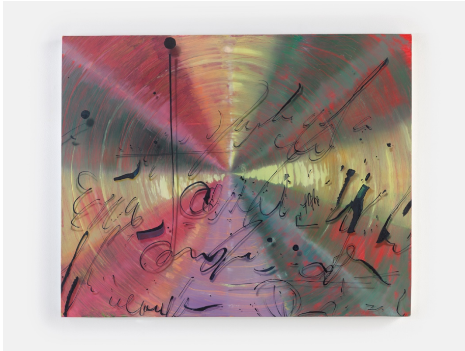
Secret Ingredient , 2024, oil on canvas, 24 x 30 in (61 x 76.2 cm)

MARCH 15 - APRIL 27, 2024 OPENING MARCH 15, 6–8 pm